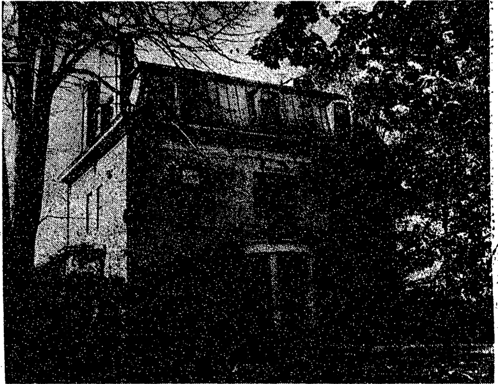
OLD SHEPHERD MANSION AS IT LOOKED IN OCTOBER, 1962