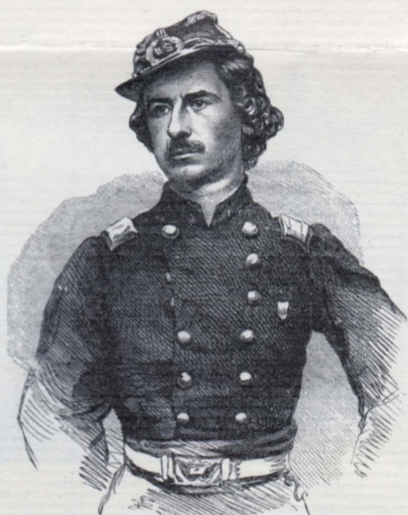
Colonel Elmer E. Ellsworth

Perhaps no other name sparked the imaginations and patriotic fervor of Northerners in the early days of the Civil War as that of Col. Elmer Ephraim Ellsworth. His pre-Civil War fame as the leader of the Chicago Zouave Cadets popularized the Zouave movement in America, and awakened interest in the military at a time when the country was on the brink of civil war. Ellsworth's dedication to the Union cause led him to raise the first volunteer regiment in the North. Yet his death at the Marshall House in Alexandria, Virginia early in the war also claimed him as the first officer to die in the conflict, and rallied the patriotic spirit of Northerners who mourned him as a martyred hero.