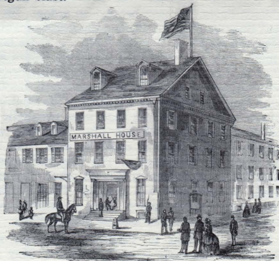
The Marshall House, Alexandria, VA Today, The Hotel Monaco stands on the former site of the Marshall House.

Ellsworth himself seems to have had a premonition of the role he would play in the Northern effort to preserve the Union. Hours before his regiment embarked for Alexandria, he addressed a prophetic letter to his parents in which he wrote: "Whatever may happen cherish the consolation that I was engaged in the performance of a sacred duty..." and that "He who noteth even the fall of a sparrow will have some purpose even in the fate of one like me..." He then adorned his uniform with a patriotic pin that bore the Latin motto: "Not for ourselves alone, but for country." This pin was found imbedded in his chest by the fatal shotgun blast.